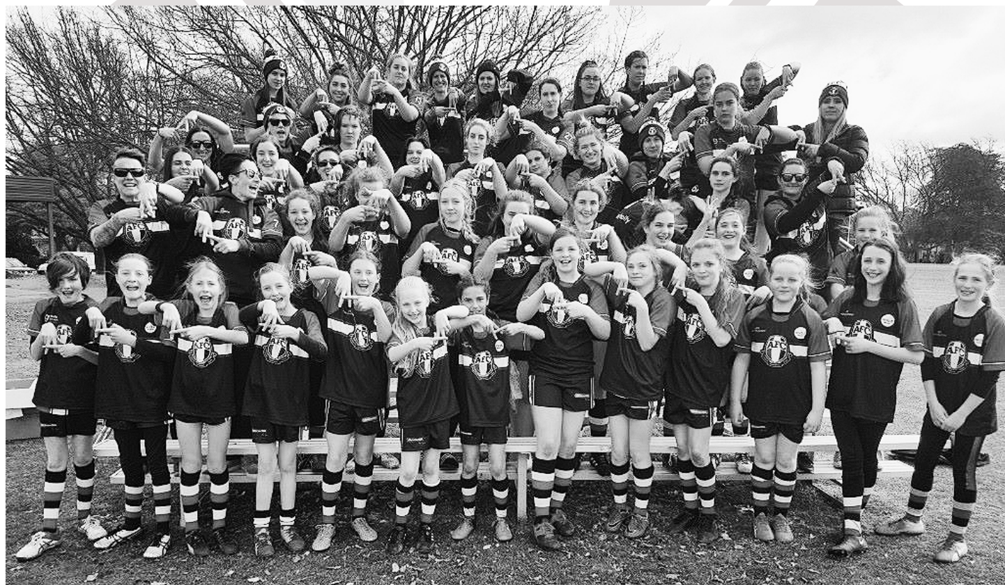
Some of our Girl's & Women's players