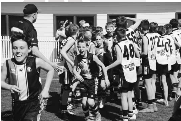
Under 11s entering ARO for GF

This year there was a slight increase in our junior registrations, with continued growth across the youth girls. We had 469 junior registrations (including u8 Auskick Pro), 327 male registrations (a slight decrease from 2017) and 141 female registrations (an increase of 42 from 2017). There were also 48 registered AusKick Rookies. This equated to 21 junior teams wearing the red, white and black.