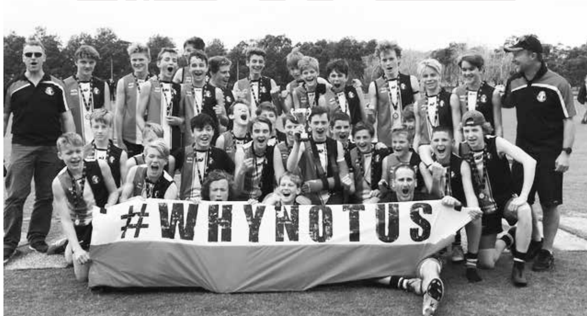
UI14s GF celebration