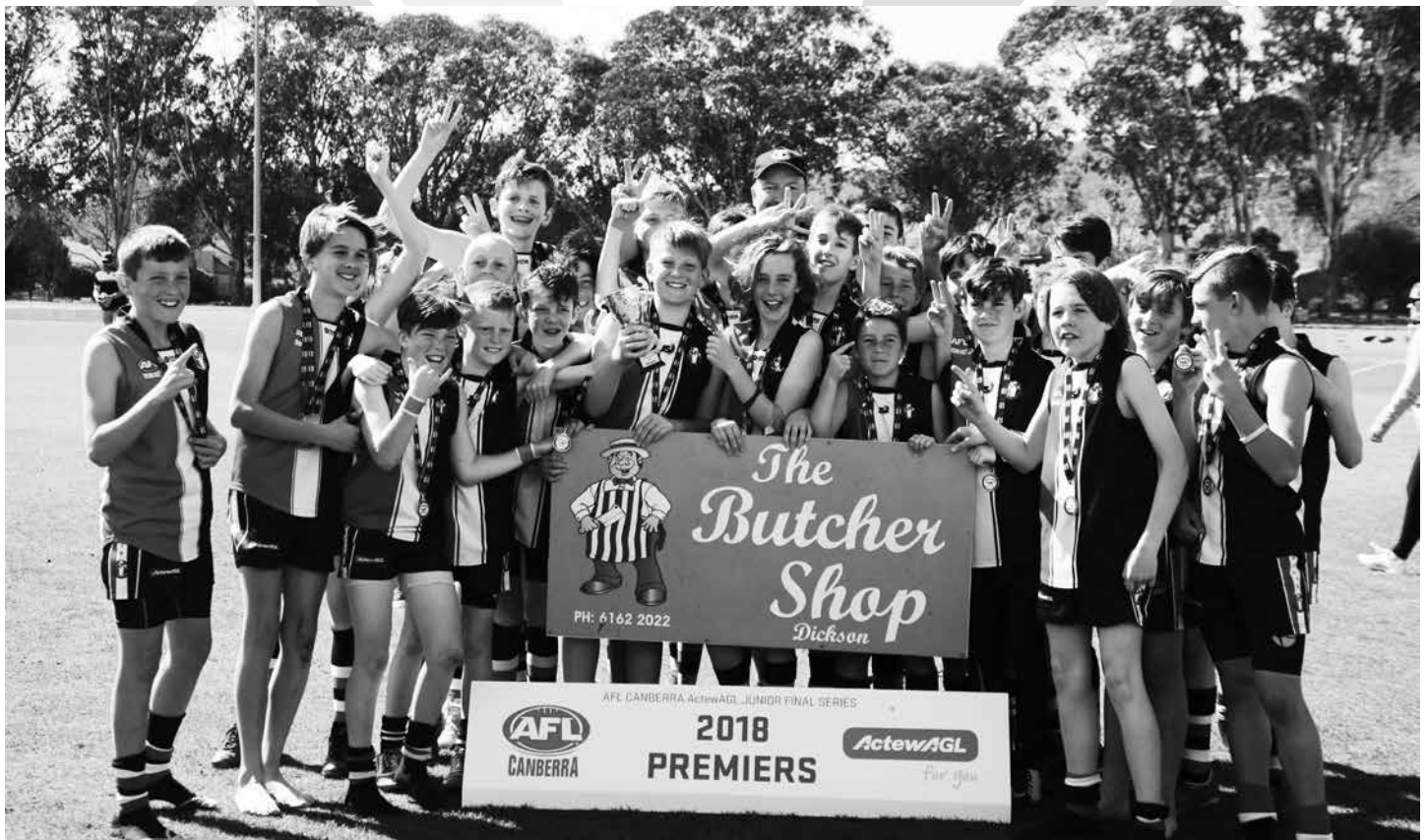
Under 13s GF Celebration